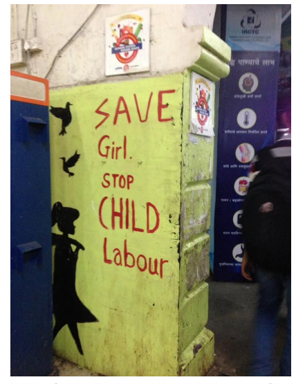
Mural at a train station in Mumbai

If you want to learn more about this topic, please contact Emma at folkerts.emma@gmail.com.